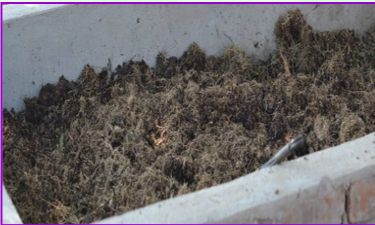
Decomposing neem leaves

leave trees, after cutting waste grass of lawn), waste of processing unit and waste of the household and guest house of the institute. These well prepared manure utilized in farm section and experimental fields for