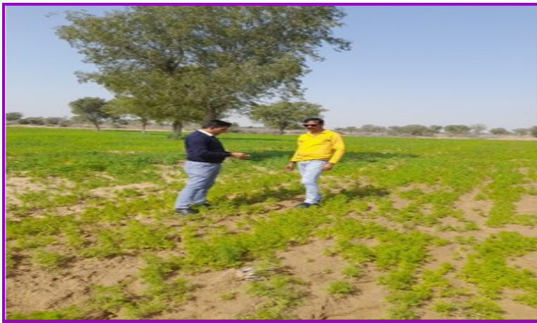
Monitoring of cumin & nigella seed production field at Nokha, Bikaner