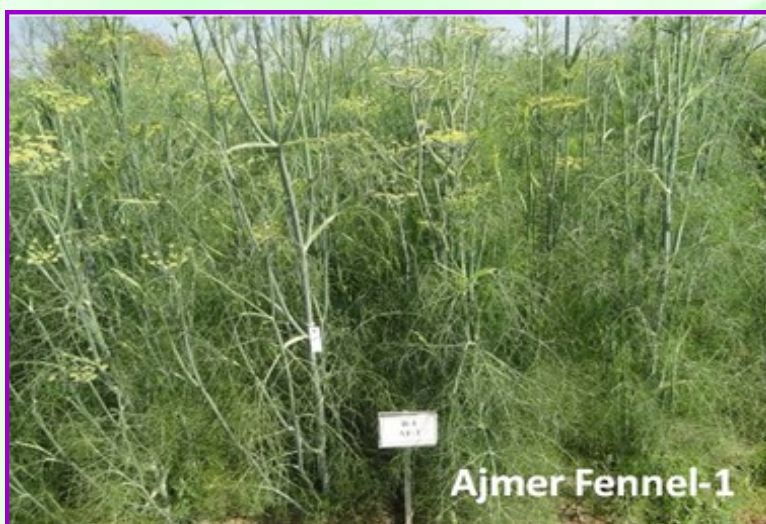
Best performing varieties of fennel (GF-12 and AF-1)

Selection of fennel varieties under organic production system is very much needed. Therefore, to find out the variety best response under organic management system, an experiment was conducted to evaluate the different fennel varieties under organic management production system at ICAR-National Research Centre on Seed Spices, Ajmer, Rajasthan under All India Network Programme on Organic Farming during the Rabi season 2015-16 to 2020-21. Eight varieties viz., AF-1, RF-101, Co-01, GF-12, Rajendra Saurabh, RF-281, RF-125 and GF-02 were tested under the organic system. The results revealed that varieties GF-12 and AF-1 performed better in organic production system than other tested varieties. The maximum plant height (cm) at harvest (179.87), number of primary branches per plant (11.19), number of secondary branches per plant (21.39), number of umbels per plant (38.83) with highest seed yield (2735.0 kg/ha) recorded in variety GF-12 followed by AF-1 (2704.31 kg/ha) and the lowest seed yield (2374.35 kg/ha) was obtained in the variety RF-101. The seed yield percent higher in variety GF-12 (15.19 %) & (13.90) in variety AF-1 over low yielding variety RF-101. Highest net return (Rs. 156124) with B: C Ratio 1: 3.49 were obtained in the variety GF-12 followed by AF-1 (Rs. 153668) with B: C ratio 1: 3.45. Hence, these two varieties (GF-12 and AF-1) can be recommended to cultivate under organic production system in fennel crop.