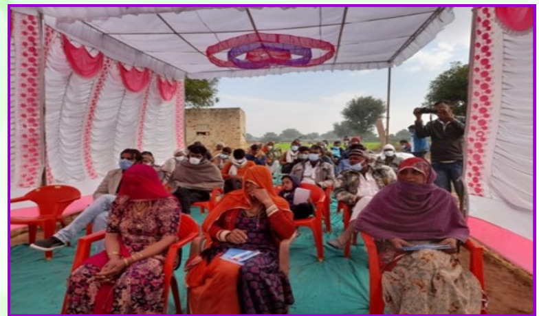
Monitoring and input distribution to Nagauri Pan Methi and cumin farmers