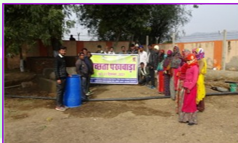
Cleaning of waste