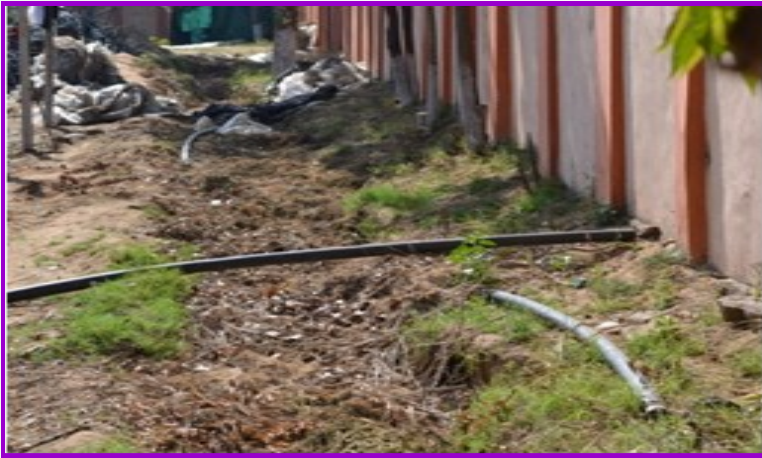
Composting of weed and tree leaves